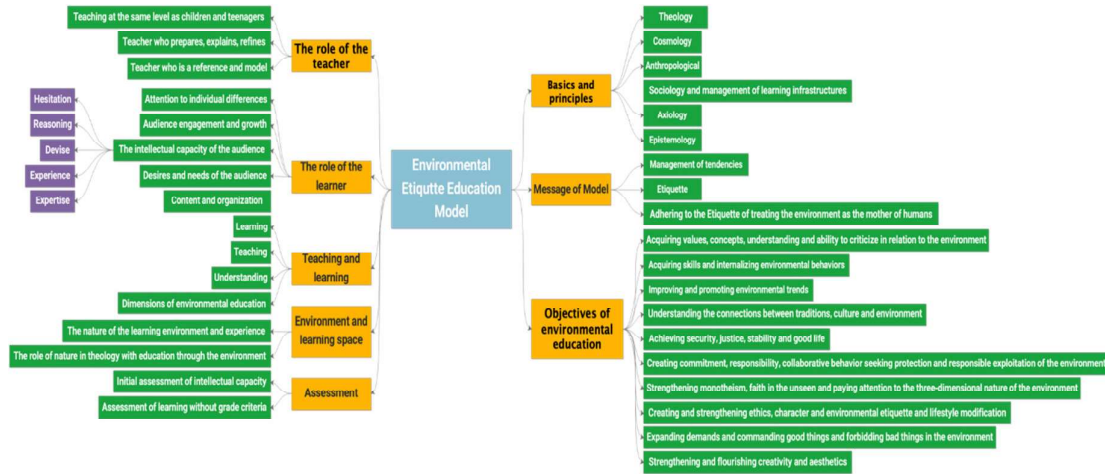
Figure 3. Environmental Etiquette Education Model from the Perspective of the Islamic-Iranian Progress Model

education model from the perspective of the Islamic-Iranian Progress Model.